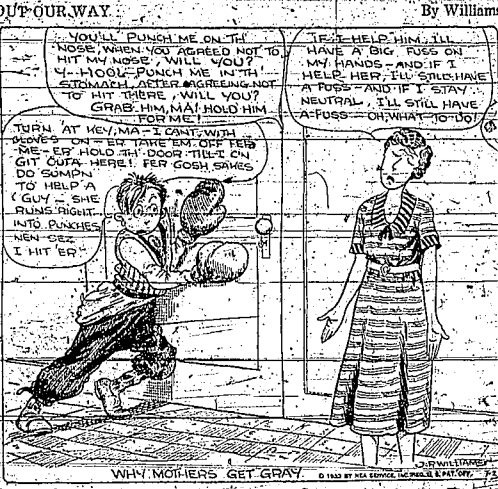
WHY MOTHERS GET GRAY. © 1932 BY THE SYGMA PAPER & PRINT CO.