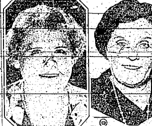
She's Marie Dressler's double... Franklin D. Roosevelt holds meetings with wide variety of subjects...