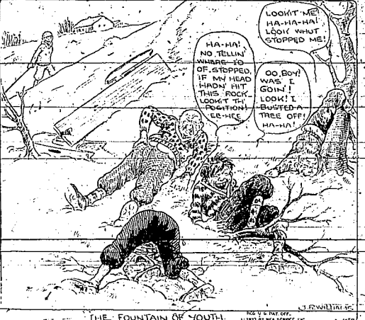
THE FOUNTAIN OF YOUTH