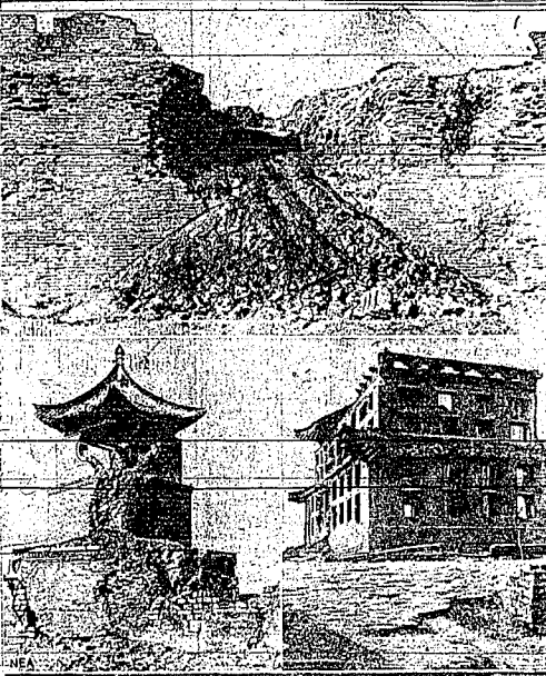
First pictures to reach America from Shanghai show the effects of Japanese bombs and cannon fire on the northern China city. Above, damaged by Japanese guns to the historic wall of China, which meets the sea at Shanghai. Below, two buildings damaged by shell and bombs as a temple near the great wall at right, a Shanghai building.