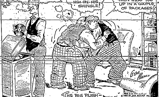
THE BIG PUSH