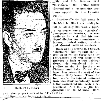
Herbert H. Block and other papers served by N.E.A. cartoonists in cartooning industry