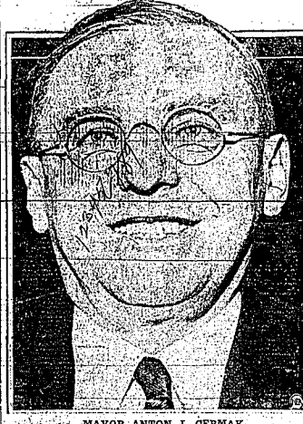
MAYOR ANTON J. CERMAK