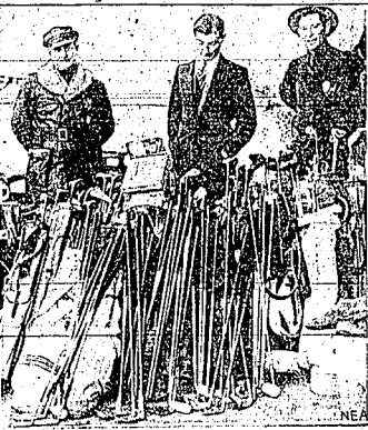
Some lady broke into the famous Pasadena Country Club at Santa Anita, Cal., last Saturday...