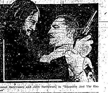
Lionel Barrymore and John Barrymore in "Hapsana And The King"