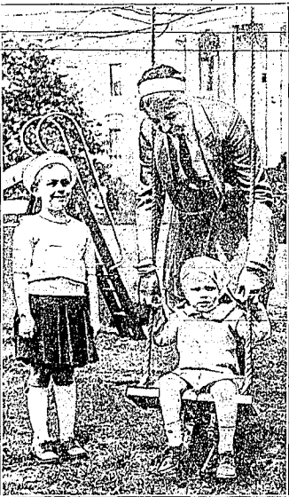
Members of the White House staff and guests at a social event.

The White House staff and guests were entertained at a social event. The program featured a variety of entertainment, including music and dancing. The event was a great success and all enjoyed it very much.