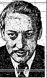
Warren Willam, co-star with Costance Cummings in "The Pick-Up" at the Orpheum Theatre.

SEA-GOING STORIES JOE BROWN'S LATEST Joe B. Brown takes a humorous look at the adventures of a man who is not a man, but a woman.