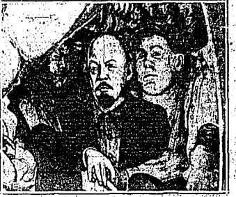
The mural which brought Rivera's discharge—Lenin joining the ranks of a soldier, White and Negro warriors.

NEW YORK (AP)—When Rivera climbed down from his mural-painting scaffolds... Propaganda in murals brings woe to Diego Rivera