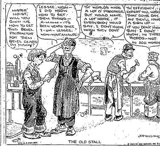
THE OLD STALL