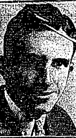
Portrait of a man, likely the subject of the 'Receives Fortune' article.