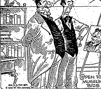
OPEN FOR MUSEUM BIDS

EXCELLENT, BERNALDY, EXCELLENT! EGAD, I'D ARRANGE TO GET THE GOVERNOR AND SOME SOCIETY LEADERS TO HAVE THEIR PORTRAITS PAINTED BY YOU. I'D SAY THAT YOU'D BE THE FIRST TO SAY 'FAMOUS' I'LL PRESENT IT TO A MUSEUM, BY JOVE 'U-M-M-HUM' I'M A DISTINGUISHED LOOKING WRETCH! YOU'VE CAUGHT IT, BERNALDY—THAT DIGNIFIED, ARISTOCRATIC LOOK OF A HOOPLE!