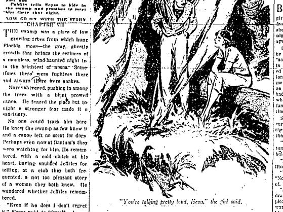
'You're talking pretty loud, Deem,' the girl said.