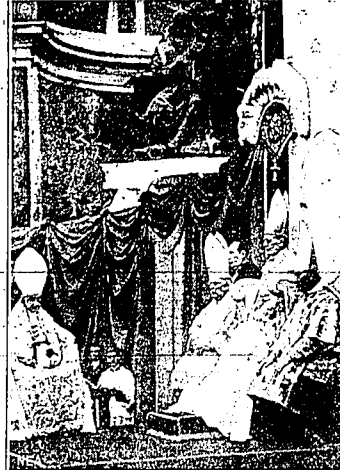
An impressive Vatican ceremony is strikingly recorded here as Pope Pius XI, surrounded by members of the Sacred College, presided at preparations for the solemn canonization of the Beata Catherine. This was in the Throne Hall.