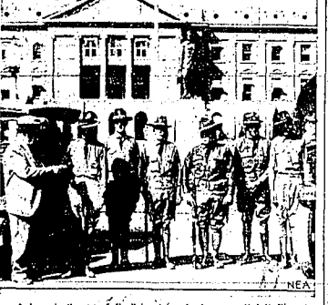
Arizona's "army of five" is pictured above as it left Phoenix for the Colorado River at Fort Huachuca to protect Arizona's rights against the Metropolitan Water District of Los Angeles. The national guardmen were ordered out by Gov. H. B. Snover.