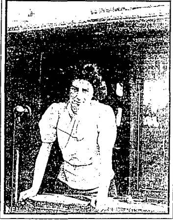
"Yep, that's what I want to be... an engineer."