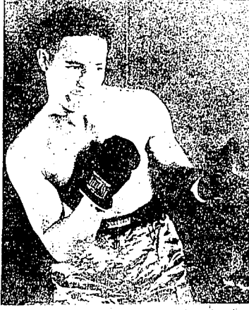
Maxie Baer, California's latest gift to the ranks of champions, held the world heavyweight boxing championship today after his tenth technical knockout over Primo Carnera in the 11th round last night.