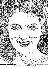
Lillian Bond in "Hell Bent for Love," now showing today and Saturday at Jostek's Romy theater.