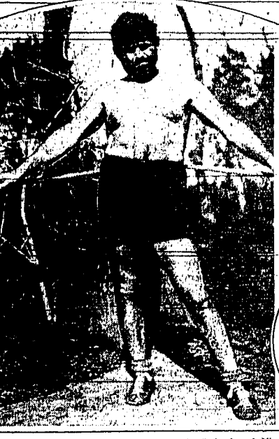
Tippling the beam at a snappy 210 pounds, Luis Angel Firpo, the Wild Bull of the Pampas, is ready to try a comeback. His first move was to challenge Jack Dempsey, who beat him in that memorable bout in New York. Despite a guarantee of $100,000, however, Dempsey declined the invitation.