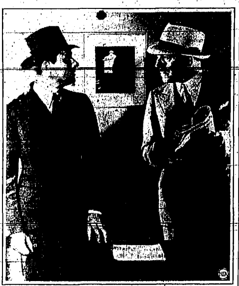
Morden stiffened as the man turned pale gray eyes on him in hostile appraisal.

CHASLIM HITCHCOCK , reporter for The Blade, brings to the attention of the public a report of the death of a man who was identified as a detective, believed to have been killed by the "MURDERER" who is now being sought by the police. The name of the man giving the name of the "MURDERER" was given to the police by a man who brought to public attention the possibility of a man who had been identified as the "MURDERER" who is now being sought by the police. It is interesting to note that the name of the man who brought to public attention the possibility of a man who had been identified as the "MURDERER" who is now being sought by the police, is the same as the name of the man who was identified as the "MURDERER" who is now being sought by the police.