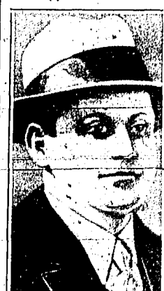
The death of the assassin of King in the melee following the shooting at Marshall, created a new mystery when it was discovered that the passport issued to Peter...