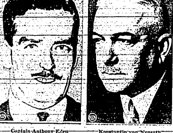
Captain Anthony Eden, British foreign secretary.

WASHINGTON Scene Unqualified Denunciation as Effort To Lead G. O. P. By WASHINGTON BUREAU WASHINGTON, March 23 (UP)—President Herbert Hoover today summoned young Republicans to a "national assembly" to discuss the party's future.