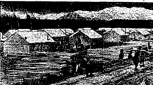
Although housed in a tent city awaiting erection of permanent homes, Matanuska Valley, Alaska, is "home sweet home" now to 600 families, driven from midwest farms by the drought, who are being established on 40-acre farms under government loans and aid. Behind the fertile valley rises the snow-capped tops of the Chugach range.