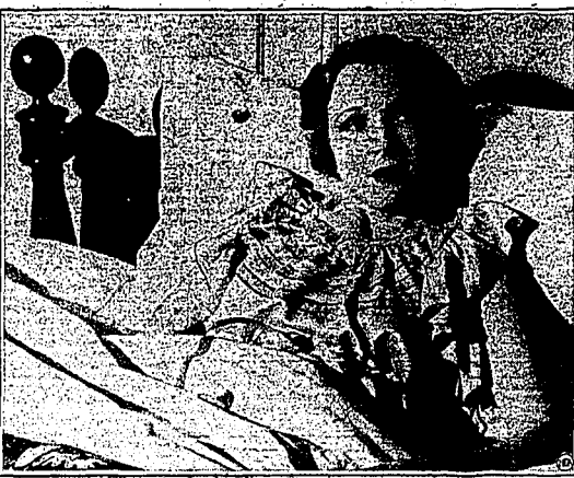
The girl, lying limp amidst the pillows in the cool, low-celled upper room, heard Michael's step on the stair.