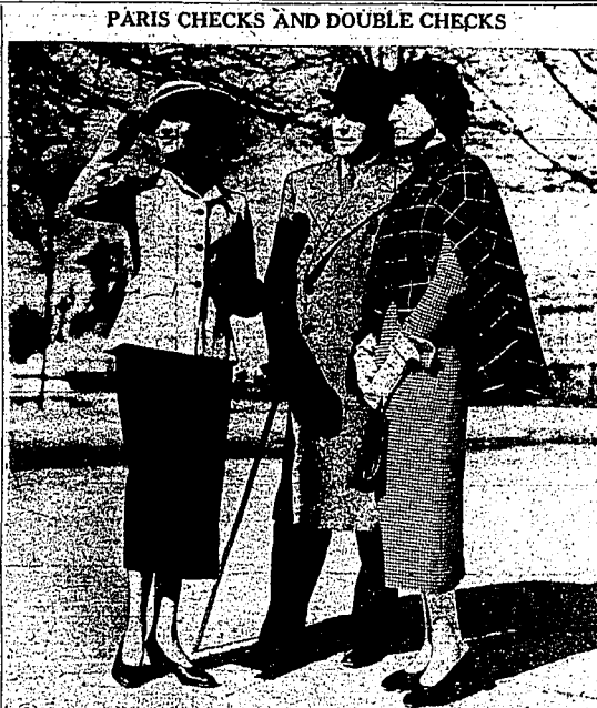
PARIS CHECKS AND DOUBLE CHECKS