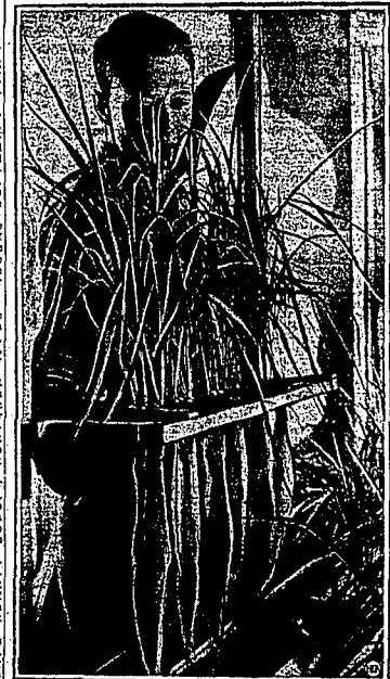
"A wheat field" without soil. Sun does not follow it. It is not a field of California wheat but the "field" in which grass is grown with temperature, humidity, and light intensity under full control of the experimenter.