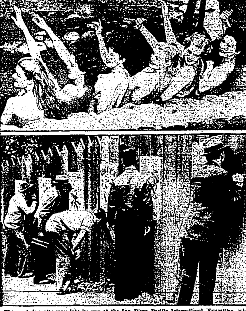
The people really came into his own at the San Diego Pacific International Exposition where visitors were permitted to get an insight into the life of a nudist colony through holes in a board fence. ... (Text describes the incident at the San Diego exposition.)