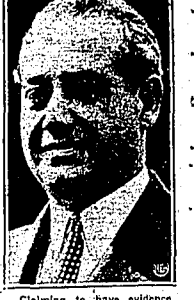
Claiming to have Hauptmann, who awaits execution for the Lindbergh kidnaping. ... (Text mentions Hauptmann's legal situation.)