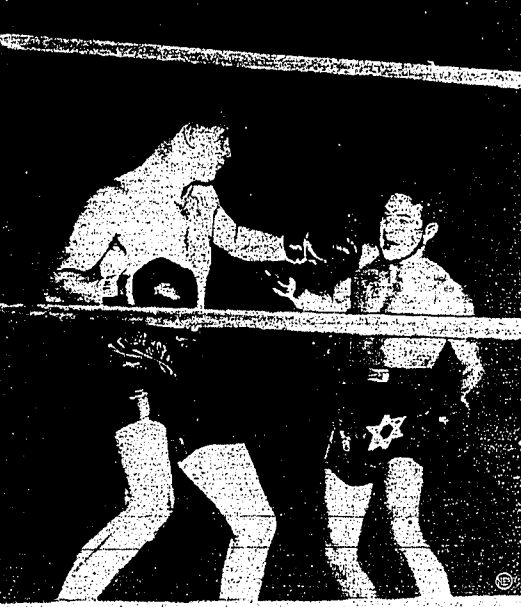
Fending off Max Baer with his left, the flat that won him the title, Jimmy Braddock, new world champion by the greatest upset in pugilistic history, here stands cool and calculating at a tenon moment in the ninth round of the battle, his right "cocked" for action, as the mauling Baer hoves in, vainly trying for an opening. Braddock won this round by a good margin, and went on to pile up the points which dethroned Baer before 30,000 frenzied spectators at Madison Square Garden Bowl.