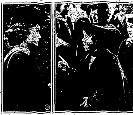
Commencement day at Sullia college, Northampton, Mass., was a gala occasion for the women of the late Dwight Morgan's family. Daughter, Constance, was graduated with a Bachelor of Arts degree and her husband, as trustee of the college helped her on daughter Anne (Mrs. Charles A. Lindbergh), who follows her in the commencement procession, an honorary degree for work in connection with Colonel Lindbergh's flight.