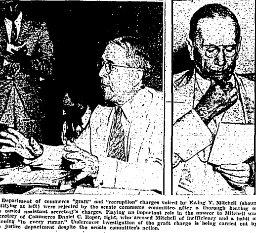
Department of commerce "grat" and "corruption" charges voted by Ewing V. Mitchell (shown testifying at left) were rejected by the senate committee committee in the answer to Mitchell was full of inefficiency and habit of listening "to every remark." Undercover investigation of the grat charge is being carried out by the justice department despite the senate committee's action.

WASHINGTON, June 25 (AP)—The senate committee today rejected the charges against Ewing V. Mitchell, secretary of commerce, that he had received $100,000 in gratifications from the United Fruit Co. in exchange for his position. The committee also rejected charges that Mitchell had received $100,000 in gratifications from the United Fruit Co. in exchange for his position.