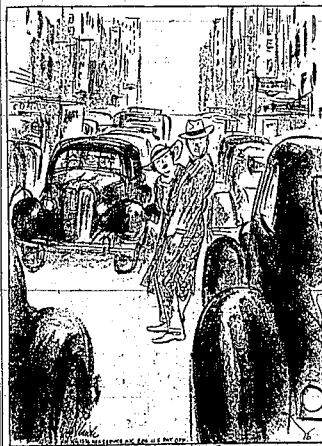
"Look, I always close my eyes, and let them go around me."