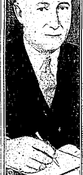
Adolph Zukor, 63-year-old producer chief of Paramount studios, today filed a $100,000 damage suit against Spanish rebels.

Revolitionists Seize Famed Resort Center