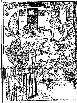
"Isn't it great to be away from it all!"