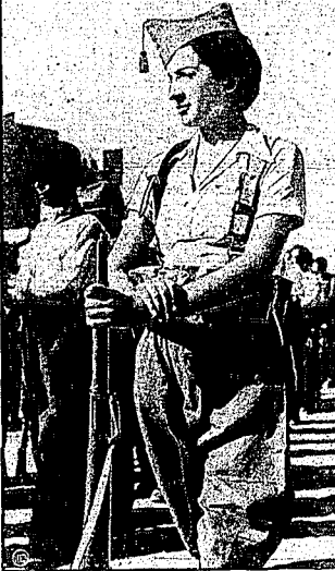
Despite the scenes of grisly... toward which she was headed... the campaign against the rebels...