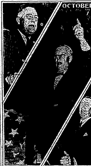
The air will be crowded with political observations Thursday, Oct. 1, when three national figures are scheduled to make political speeches by radio at the same hour.