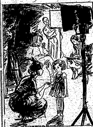
"Now, do the best you can, darling; so Daddy won't have to go back to that old law wagon."