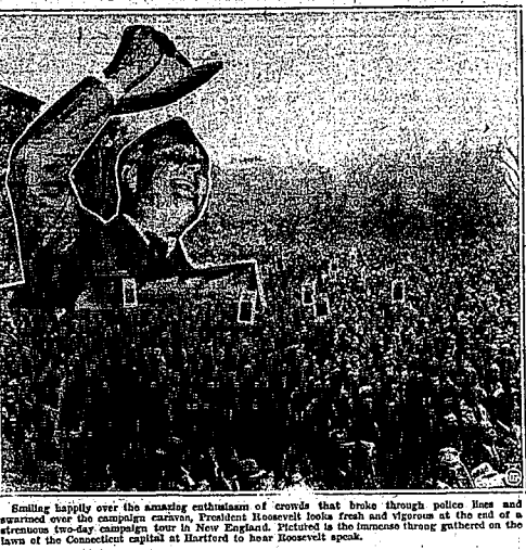
Smiling happily over the amazing enthusiasm of crowds that broke through police lines and swarmed over the campaign caravan, President Roosevelt looks fresh and vigorous at the end of a strenuous two-day campaign tour in New England.