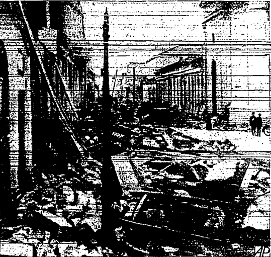
Towns, plumed from Concepcion, Chile, to Buenos Aires and sent there by rail to New York, showing a general debris-strewn street in Concepcion following the disastrous earthquake in Chile between 1938 and 1939. The toll continued to mount as small towns in the stricken area of 18,200 square miles re-established contact with the outside world.