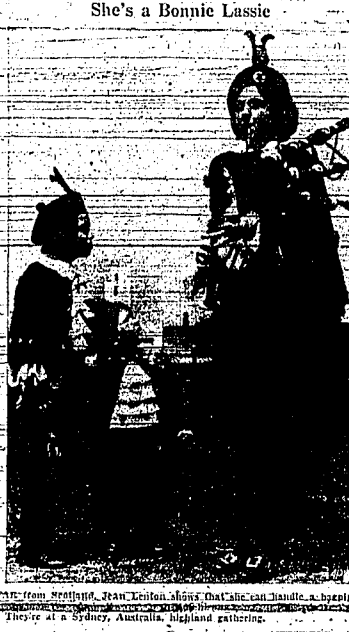
She's a Bonnie Lassie