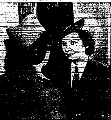
PROUD of the snappy new reforms that has just been adopted by the Union Pacific Railroad...