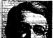
DONALD S. WHITEHEAD, Idaho lieutenant governor, says it will be necessary to make plans for the annual job week-union (seasonal) surveys.

Whitehead asserted the governor's basis of "Hitlers" then turned the subject to make plans for the annual job week-union (seasonal) surveys.