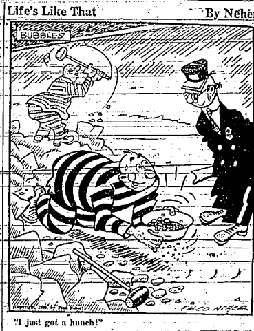
"Just got a hunch"

FARM IMPLEMENTS FULL outfit for small farm. Terms: $29.00. MISC. IMPLEMENTS NU FANCH tumble-pump with new tire. SWEET DIRT, alfalfa seed. DICKLOW Seed, what. 1 ml. No. 2 E. Kimberly. BLISS Triumph seed. New Zealand white rabbits, hutchers, 6287-2112.