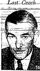
VALDINEK HUBERMAN, Czech minister of foreign affairs...

Administration Leader Calls for Speed in Preparations for Potential Defense Action