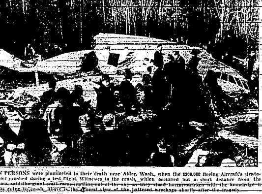
TEN PERSONS were plumed to their death near Alder, Wash., when the $500,000 Boeing Aircraft's strato crashed during a test flight.

CHICAGO, March 20.—Ten persons were killed and 15 injured today when a Boeing Stratoliner crashed during a test flight near Alder, Wash.