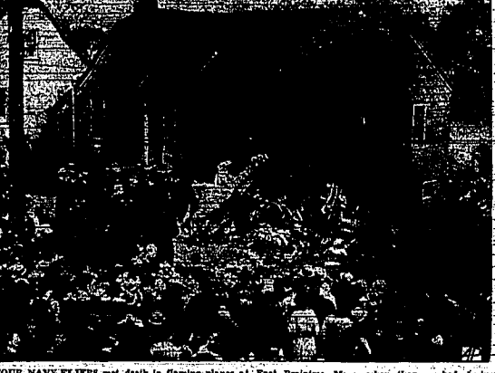
FOUR NAVY FLIERS met death in flaming planes at East Brattleboro, Mass., when they crashed during maneuvers in connection with the launching of the nation's latest addition to naval armament—the big airplane carrier Wasp. The planes crashed in mid-air and fell on houses. This house on Shepard street, East Brattleboro, was the first where the plane struck.

Flaming Planes Plummet Four Fliers to Death