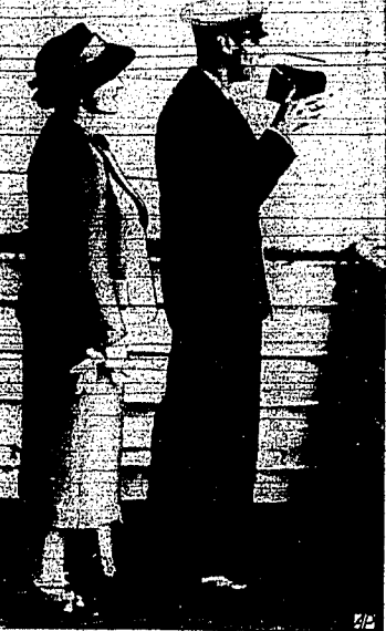
JUST like any other flier, King George VI and his queen, Elizabeth made pictures aboard the Empress of Australia as they sailed from England to Canada for their visit. The Empress and her two-crewed escort were met by two Canadian destroyers in Cabot street yesterday and Quebec prepared for a gala reception. This picture was taken back to England by the cruiser Repulse and then cabled to New York.