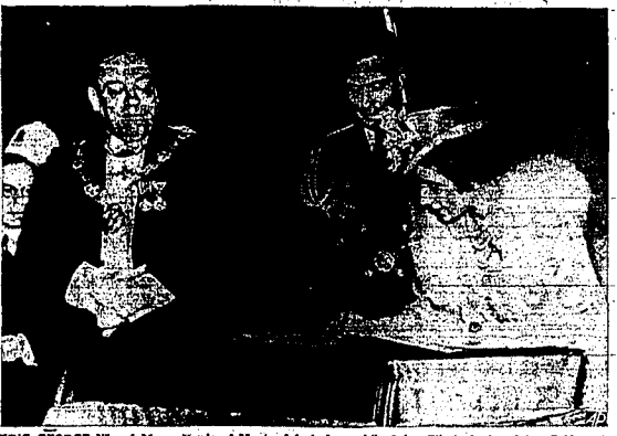
KING GEORGE VI and Mayor Houde of Montreal looked on, while Queen Elizabeth signed the Golden Visitor Book at the Hotel City last night.