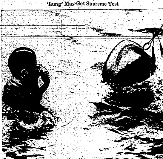
THE NAVY'S newly perfected escape "honey," invented by Lieutenant Commander C. B. Mowmen, may be used to rescue 62 men trapped under 240 feet of water in the partially-flooded submarine Squalus. Navy officials indicated a diving bell would first be tried if the submarine could not be raised to the surface, and, that falling, Mowmen's device used. Mowmen is shown with the "honey" which consists of a mouthpiece and a bag of oxygen, together with the device at right to pull them into rescue boats.