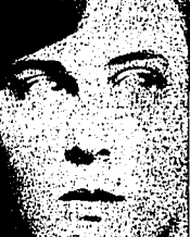
By The Associated Press

Glass Panel Mysteriously Shattered at Home of Princess Royal, British King's Only Sister