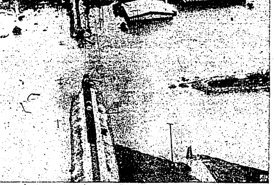
THIS was the scene at Colorado City, Tex., after heavy rains had sent west Texas streams out of their banks, leaving two dead, several injured, hundreds homeless and extensive damage.