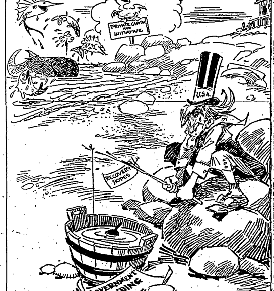
Simple Simon went a fishing for to catch a whale. The illustration shows a man in a boat with a fishing net, and a large fish (whale) nearby.