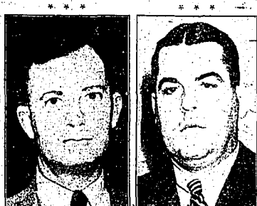
EARL K. LONG (left), brother of the late Huey-P. Long, was sworn in as governor of Louisiana at 7:15 p. m. tonight after Governor Richard W. Leche stepped down as a climax of a day of swiftly moving developments obscured by mystery, scandal and embezzlement charges.