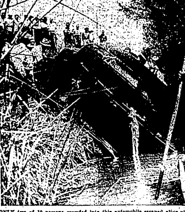
ONLY two of 10 persons crowded into this automobile escaped alive when it careened off a ledge into the San Joaquin river near Byron, Calif. during a bonanza ride from a picnic. Car is shown as it was being pulled from river, with diver standing at right. Most of the victims were San Franciscans.