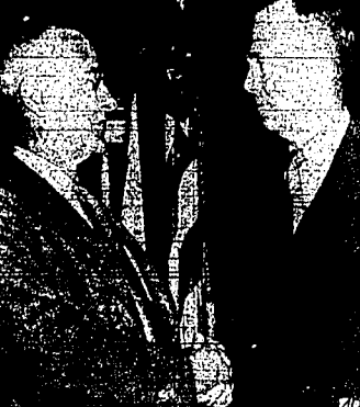
ALTHOUGH he isn't officially off the job until Aug. 5, General James Craig (left) has turned over his job as chief of staff of the U. S. army to Brig. Gen. George C. Marshall (right), and the two are shown as Craig congratulates his successor. The retiring chief of staff said he plans to live in San Francisco "and keep my mouth shut." Marshall will take over July 1.