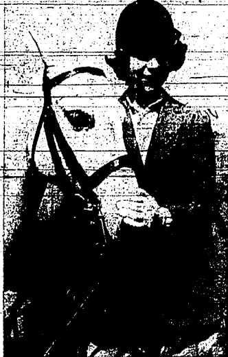
ENGLAND'S PRINCESS ELIZABETH, who recently graduated from high school, is being prepared for a future queen.