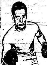
BILLY CONN, above, punched out Bettina last night to win the world light-heavy-welter title. He also had a hand in two hits during the nine-inning contest. He also had allowed only two hits during the nine-inning contest.

Pittsburgh Scraper Triumphs Before 15,295 Fans