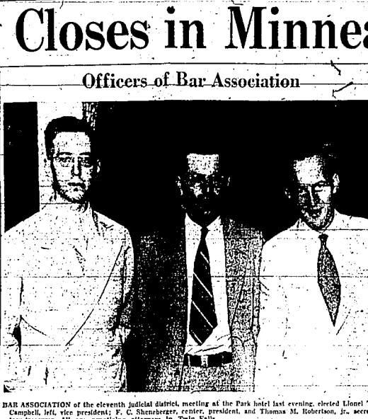
Officers of Bar Association

ANTI-BRITISH DRIVE AIMED AT CONSULATE Tokyo Demonstration Coincident With Parade of British, French Military, Naval Power in Paris