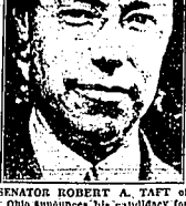
SENATOR ROBERT A. TAFT of Ohio...