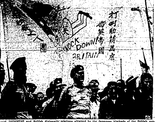
Several Japanese and British diplomatic relations strained by the Japanese blockade of the British consulates in Tientsin, China, the situation was not helped when Chinese staged a demonstration in the Chinese city. A group of the White Russians and Chinese are shown with one of their banners, which reads: "Down with tyrannical Britain which aids Chiang Kai-Shek."