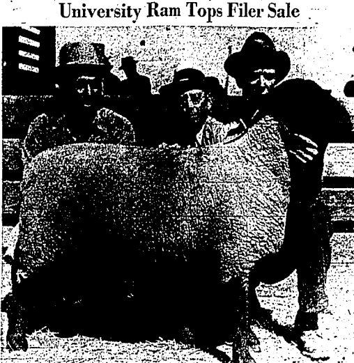
UNIVERSITY OF IDAHO SUFFOLK STAM RAM BROUGHT THE TOP PRIZE OF $500 AT THE 18TH ANNUAL FILTER RAM SALE

LEGISLATORS WENT BACK AT THE HOUSE Wisconsin Senator Dissents From Roosevelt's Charge That Congress Gambles With Humanity's Welfare