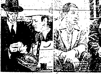
GENE ATTY of the film set baseball film from Connie Mack of the Athletics.