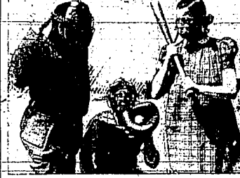
FANNY BRICE, him and traded long and valued the Chicago White Sox training camp and headed east with the umpire said Fanny.