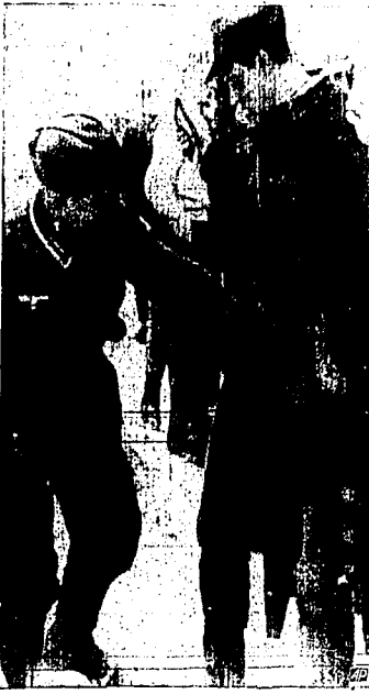
GERMAN-CENSORED description of this picture, pulled from Berlin to New York, says it shows a German non-commissioned officer searching a captured Norwegian soldier for arms. No other information was given.