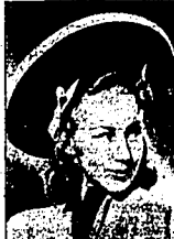
ANNE SHIRLEY'S sailor hat is navy blue felt, the sweater being navy with white "waifu weave" piping. Tucked under the brim, on either side, a bow of paper.