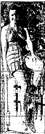
A FAVORITE playtime ensemble of Maureen O'Hara has stripes of orange, blue and pink and a white skirt...