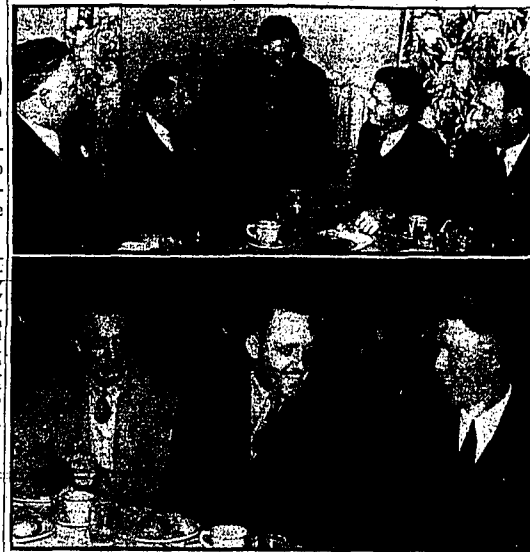
SCENES at last night's Junior Chamber of Commerce dinner in honor of the Twin Falls Cowboys...