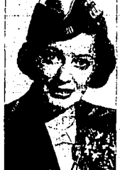
ELLEN DREW (above), film actress, has been named 1946 national poppy girl by the Veterans of Foreign Wars of U. S. She is hostess of the V. F. W. camp, scheduled for Aug. 24 at Los Angeles.