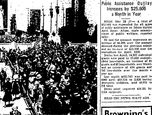
WHILE opening day spectators watched, the seal of the 1940 Golden Gate International exposition was "broken" on Treasure Island by Mayor Charles L. Brannan.

Public Assistance Outlay Increases by $25,606 a Month in Year. BOISE, May 28 (AP)—A total of $314,466 was expended for all types of public assistance in Idaho during April. Mayor Arthur L. Brannan, state commissioner of public welfare, reported today.