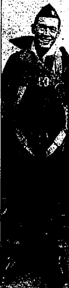
Eugene A. Schulz, 19, killed in airplane crash.