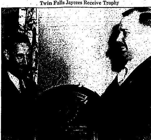
Twin Falls Jaycees Receive Trophy